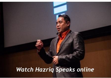
Watch Hazriq Speaks online