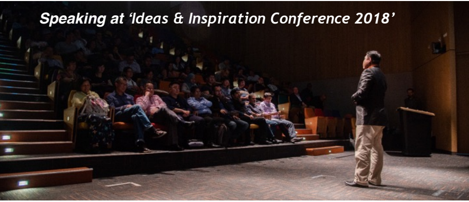
Speaking at 'Ideas & Inspiration Conference 2018'